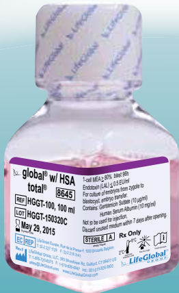
global® total® w/ HSA

The system that's good for both embryo and embryologist.