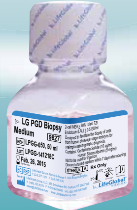
LG PGD Biopsy Medium

The global® Family – A Unified Approach to Embryo Culture