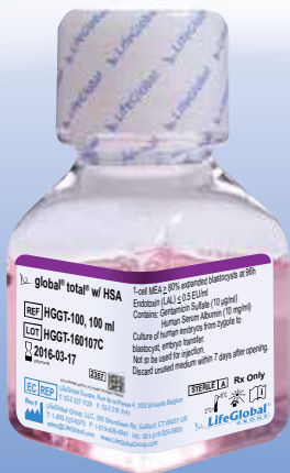
global® total® w/ HSA

The system that's good for both embryo and embryologist.