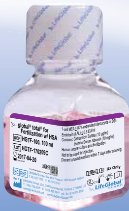
global® total® for Fertilization w/ HSA