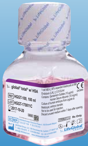
global ® total ® w/ HSA