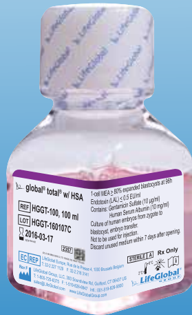
global ® total ® w/ HSA