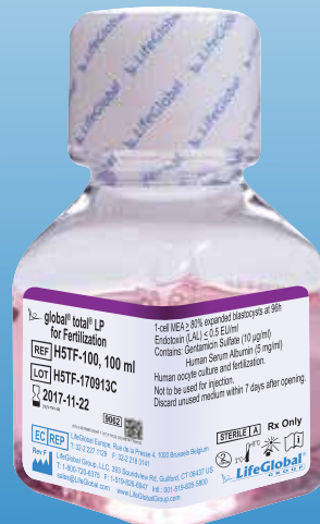
global® total® LP for Fertilization