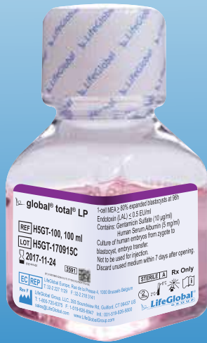
global® total® LP